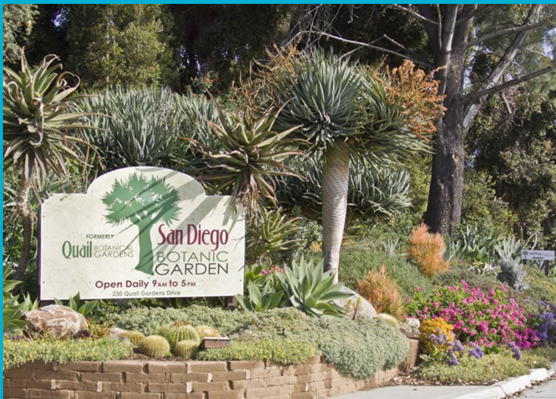
"SAN DIEGO BOTANIC GARDEN" - (above)

The San Diego Botanic Garden is a magnificent botanical garden located in Encinitas, California. The botanic garden offers a spacious 37 acres (150,000 m 2 ) of amazing garden space. The gardens include rare bamboo groves (said to be the largest bamboo collection in the United States), desert