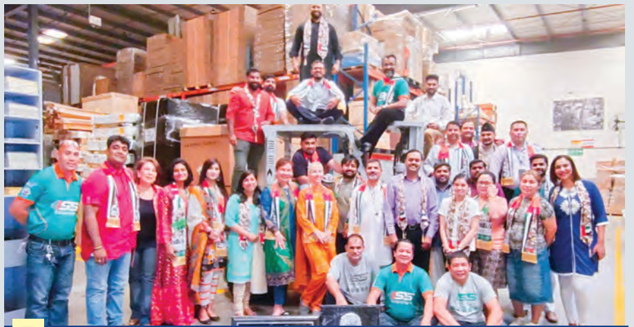
5 ISS Relocations