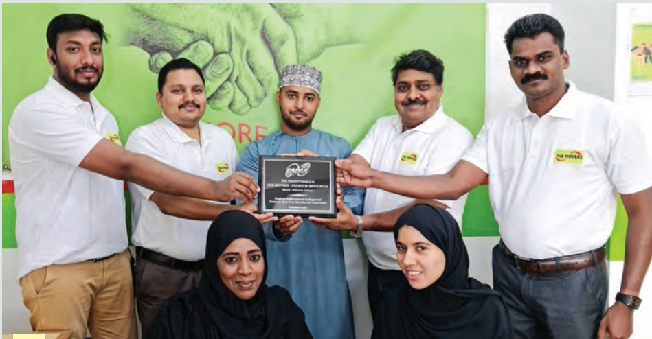
6 The Movers - Sultanate of Oman