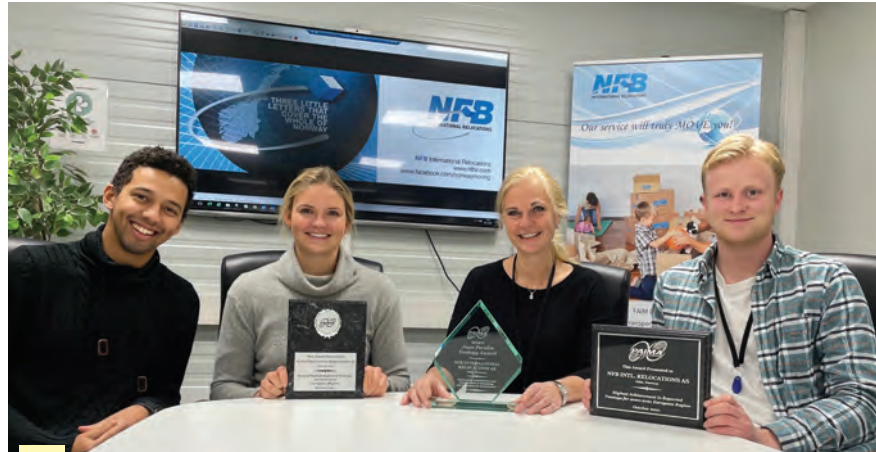
1 NFB International Relocations, Norway

In the last issue of PAIMA Report we announced the winners of the 2021 tonnage awards. Unfortunately, as the annual conference was cancelled due to COVID-19, the winners were not able to be presented with their awards in person. However, ever resourceful, the PAIMA office posted trophies to the winners and asked them to send back a photo of their rightly proud staff. Here are those who responded with the table below linking the pictures and winners' details.