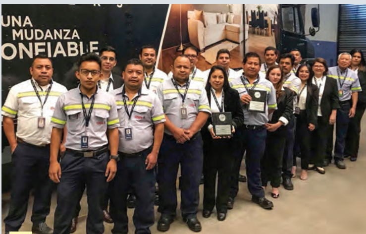
9 Swiss Global Movers