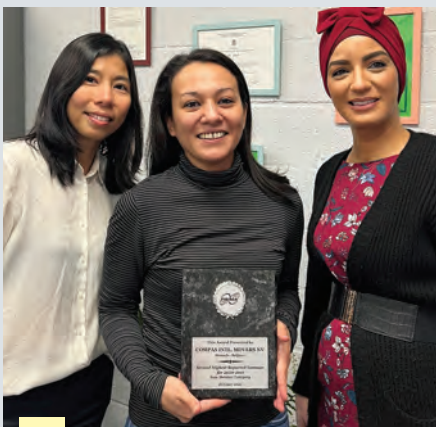
8 Compas International Movers