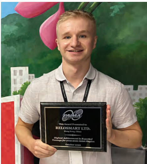
2 Relosmart Ltd