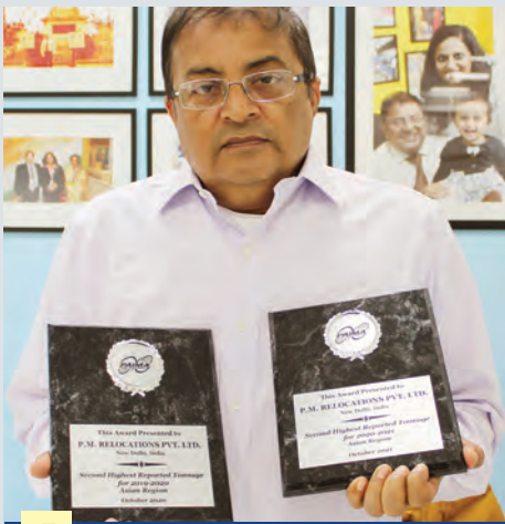
4 PM Relocations