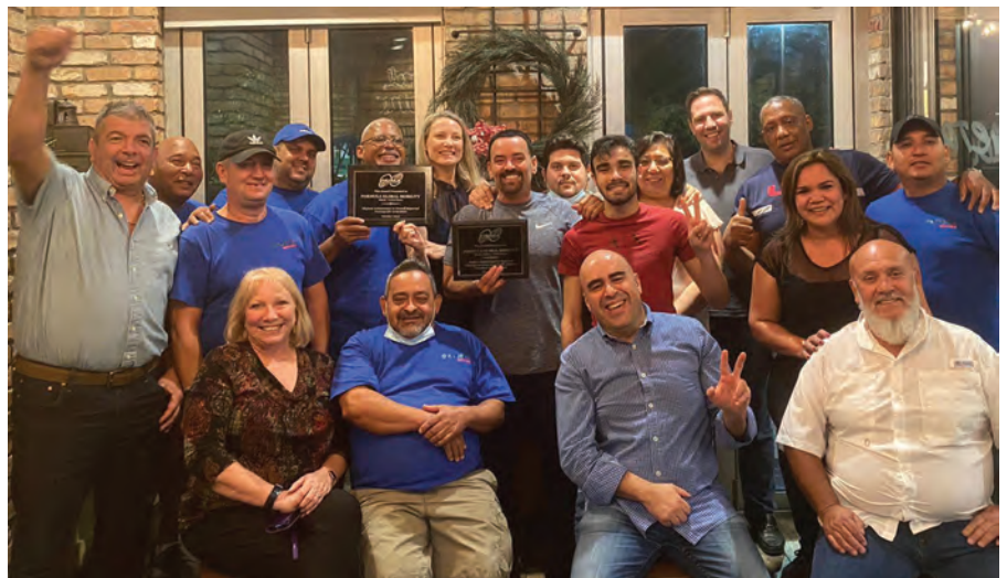
3 Formula Global Mobility